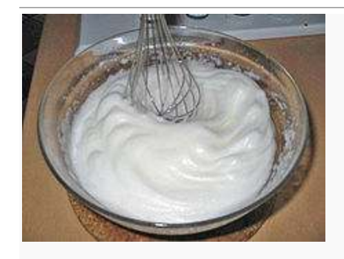
Beaten egg whites

When egg whites are beaten, some of the hydrogen bonds in the proteins break, causing the proteins to unfold ("denature") and to aggregate non-specifically. This change in structure leads to the stiff consistency required for meringues. The use of a copper bowl, or the addition of cream of tartar is required to additionally denature the proteins to create the firm peaks, otherwise the whites will not be firm. Plastic bowls, wet or greasy bowls will likely result in the meringue mix being prevented from becoming peaky. Wiping the bowl with a wedge of lemon to remove any traces of grease can often help the process.